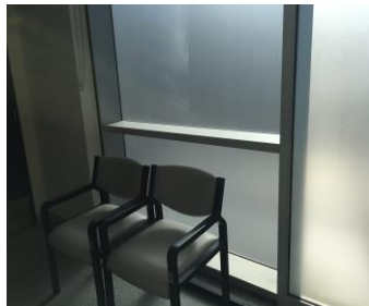
Our waiting area