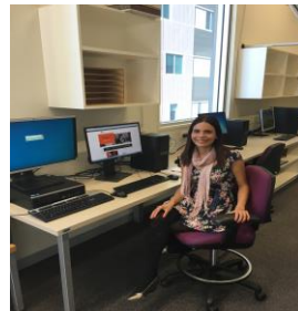
Some office space